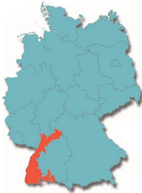
The Grand Duchy of Baden, Germany